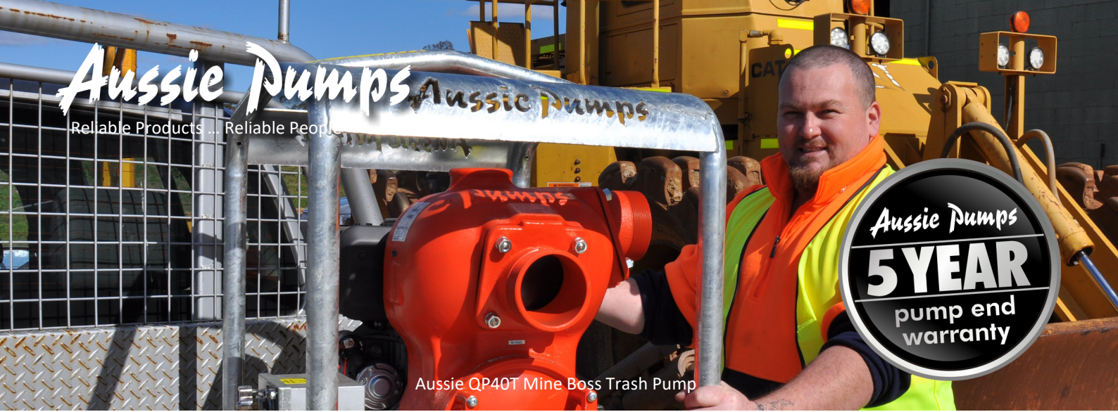
Aussie QP40T Mine Boss Trash Pump