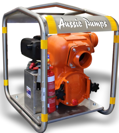
QP40T L100E Mine Boss