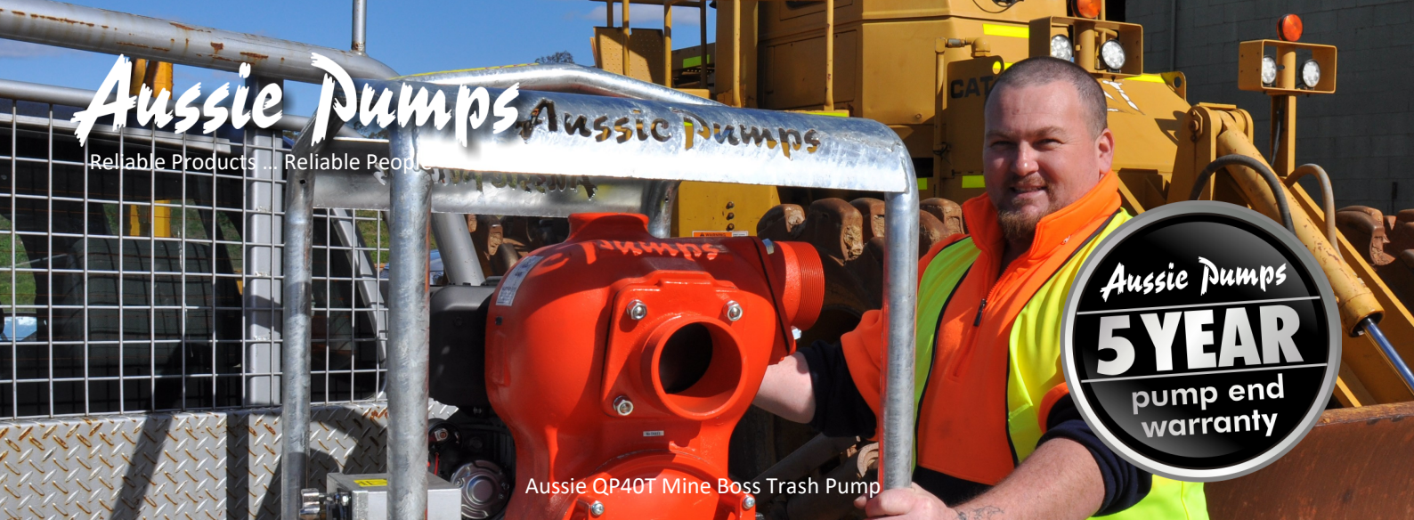
Aussie QP40T Mine Boss Trash Pump